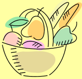
The Wellness Committee

The Staff has had Secret Snack day, and we are coordinating with the Sunshine Committee to have an April Appetizers day. Plus, we are currently in a Spring Step Challenge.